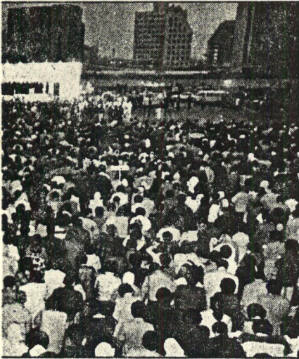
Korea Herald in an Easter service which was held on morning. The dawn service was jointly held in the country.